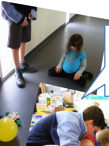
Mount Scopas Memorial Collage Students Year 9 Science Visit