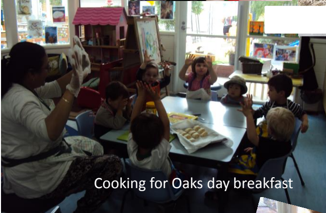
Cooking for Oaks day breakfast