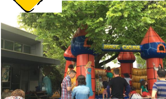
KCCC Christmas Party