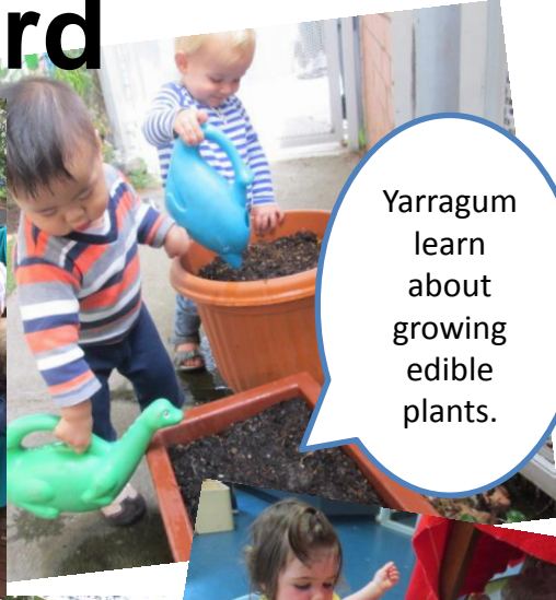
Yarragum learn about growing edible plants.