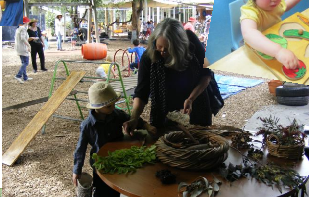
Teatree Grandparents Day