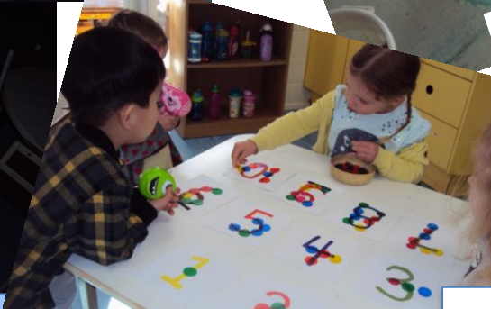
Number recognition in Boronia Room