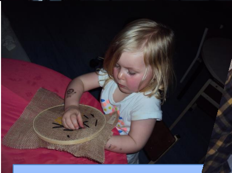
Waratah extend fine motor skills and sustained focus through sewing