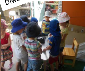
Acacia explored recycled materials for art in the new outdoor art station